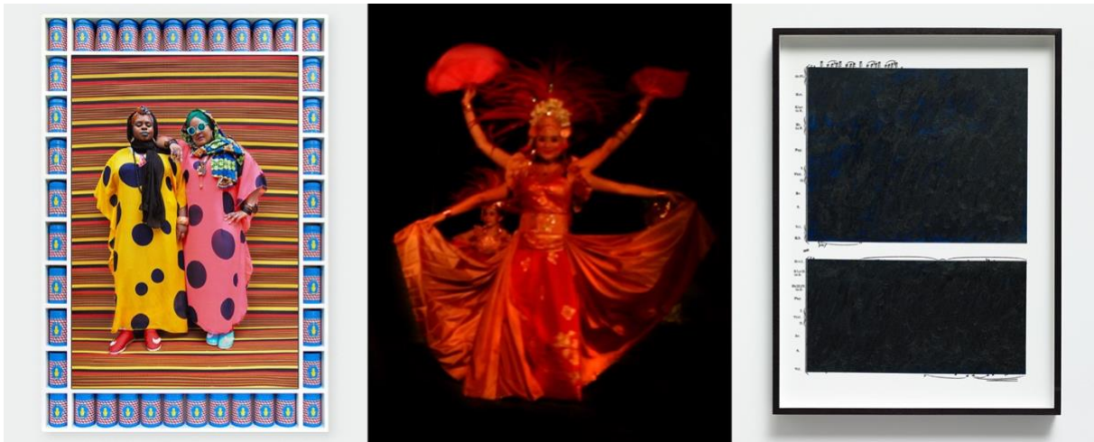
Hassan Hajjaj, Muneera & Sukina, Aka Poetic Pilgrimage 2016/1437 (Gregorian/Hijri), Metallic Lambda on 3mm Dibond in a Poplar Sprayed-White Frame with Blue, Image: 44" x 30", framed: 56" x 38 3/8" x 3 1/8" | Bettina WitteVeen, Sparks Of The Deity, 2018 , film still (detail) | Idris Khan, Blue Rhythms, 2019 , gesso and oil stick on 18 premier black and white fiber prints mounted on aluminum, 31 1/8 x 23 1/4 x 2 3/16 inches (framed, each) overall, framed: 66 1/4 x 241 1/4 x 2 3/16 inches

Programming for the show includes concerts, artist talks in the galleries, lectures and a director's seminar series. A fully illustrated catalogue with essays by the curators and a musical score composed on commission is available. The catalogue was made possible with an anonymous donation, and the exhibition is supported by a grant from the Claire Friedlander Family Foundation.