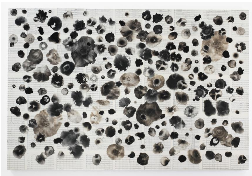
Tim Rollins and K.O.S., A Midsummer Night's Dream (after Shakespeare and Mendelssohn) , 2014, watercolor, ink, fruit juices, Thai mulberry paper, collage, mustard seed, music score pages on canvas, 48 x 72 inches, courtesy of Studio K.O.S. and Lehmann Maupin, New York, Hong Kong, Seoul, and London

Programming for the show includes concerts, artist talks in the galleries, lectures and a director's seminar series. A fully illustrated catalogue with essays by the curators and a musical score composed on commission is available. The catalogue was made possible with an anonymous donation, and the exhibition is supported by a grant from the Claire Friedlander Family Foundation.